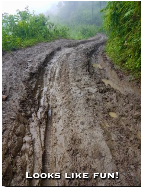
LOOKS LIKE FUN!

some of the Hmong villages even just a few miles off the main road can