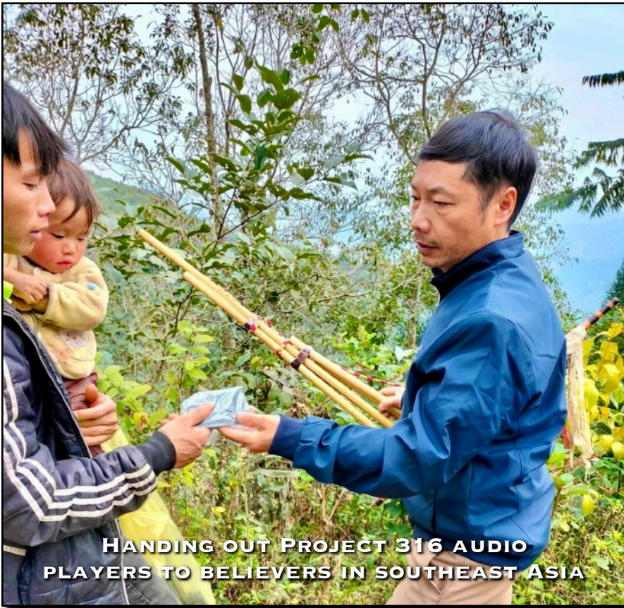
HANDING OUT PROJECT 316 AUDIO PLAYERS TO BELIEVERS IN SOUTHEAST ASIA