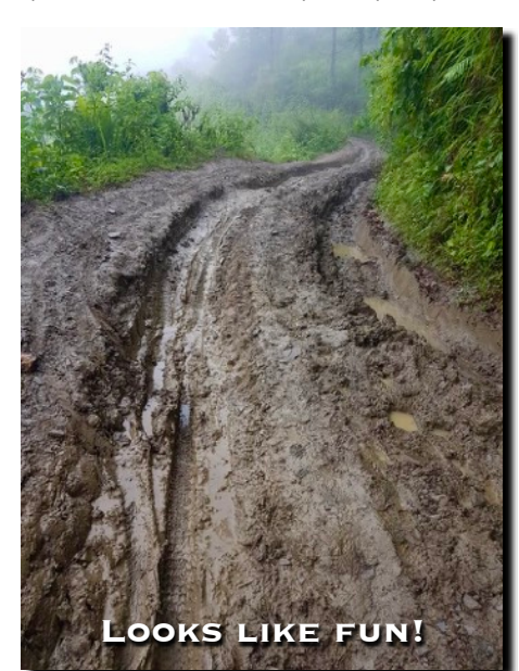
take several hours and is only accessible by motorbike or walking.

some of the Hmong villages even just a few miles off the main road can